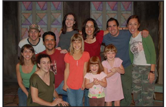
The Circus Theatricals Week 50 Ensemble

In November 2002, the Pulitzer prize-winning Suzan-Lori Parks sat down and committed to writing a play a day for the next 365 days. The world premiere of this play cycle will be performed as a yearlong national festival simultaneously in major cities and communities around the country. From November 13, 2006 to November 12, 2007, over 600 theatres in Atlanta, Denver, Seattle, San Francisco, Austin, Washington D.C., Chicago, Minneapolis, the Caro-